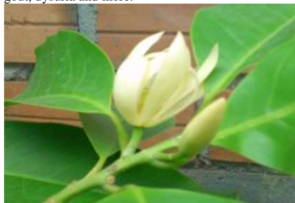
Fig. 1: Michelia Champaca : A Flowering Twing

Michelia champaca L. (Magnoliaceae) commonly known as Champa wild in the eastern sub-Himalayan tract and lower hills up to 3,000 ft. and found in Assam, Burma, South India. The plant is a handsome, evergreen shrub. Leaves 15- 25 by 5-9 cm., lanceolate, acute, entire, glabrous; petioles 18-25mm long. Flowers about 5-6.2 cm. diameter, very fragrant, greyish yellow pubescent. Sepals and petals 15 or more deep yellow or orange. Grey or brownish bark. Seeds 1-12, brown, polished, variously angled, rounded on the. Its flowers and stem bark are useful in diabetes, quick wound healing, cardiac disorders, gout, dysuria and more. 2-4